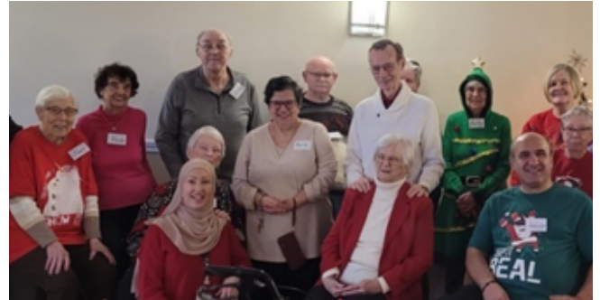
Seniors Social Circle

The EORC partnered with the Gloucester Emergency Food Cupboard to secure $30,000 from the Ottawa Food Bank to enhance food security for our hotel and shelter clients. This funding allowed our new outreach worker to deliver additional frozen meals and improve access to other EORC services.