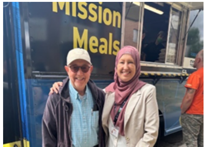
New Food Mission Stop