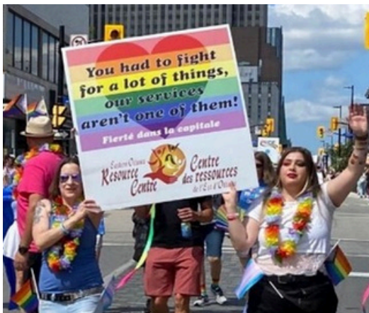
EORC at Pride 2023

The Resource and Referral program continued to receive a high volume of requests, particularly for the Hydro Low-Income Energy Assistance Program (LEAP), the Ontario Electricity Support Program (OESP), and our food cupboard. Seasonal initiatives such as Teen Angels, Back to School, and Christmas Exchange programs were also in very high demand this year, highlighting the ongoing financial struggles within our community.