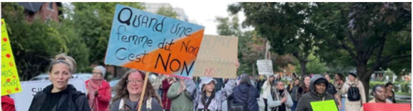
"Take Back the Night" Women's March

Additionally, the EORC Family Court Support worker contributed to a University of Guelph study on the needs of diverse survivors of intimate partner violence and participated in the Domestic Violence Case Review Committee.