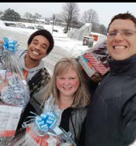
Youth delivering Christmas baskets