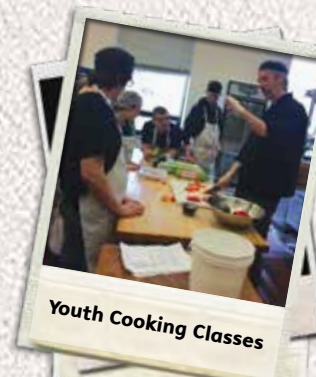
Youth Cooking Classes