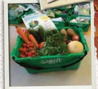
Good Food Box