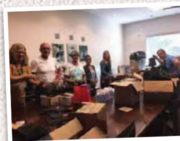
Volunteers hard at work preparing for Cruise don't Bruise