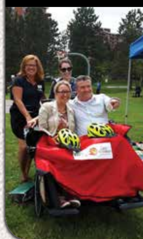
Cycling without Ages

Help EORC Raise funds by Shopping Online: https://www.eorc-creo.ca/WebGiv.php