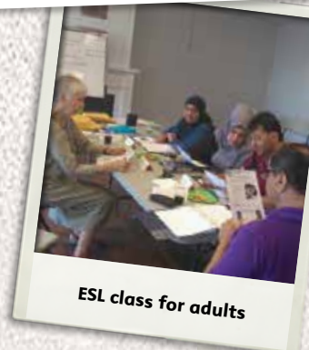
ESL class for adults