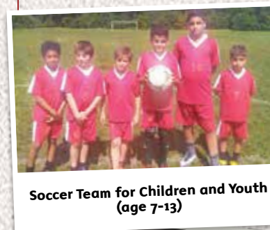
Soccer Team for Children and Youth (age 7-13)