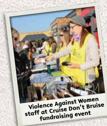
Violence Against Women staff at Cruise Don't Bruise fundraising event