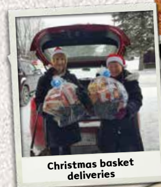
Christmas basket deliveries