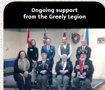
Ongoing support from the Greely Legion