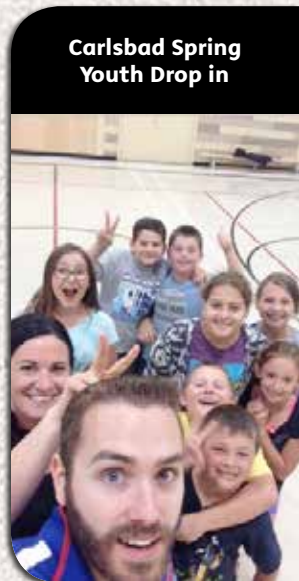
Carlsbad Spring Youth Drop in