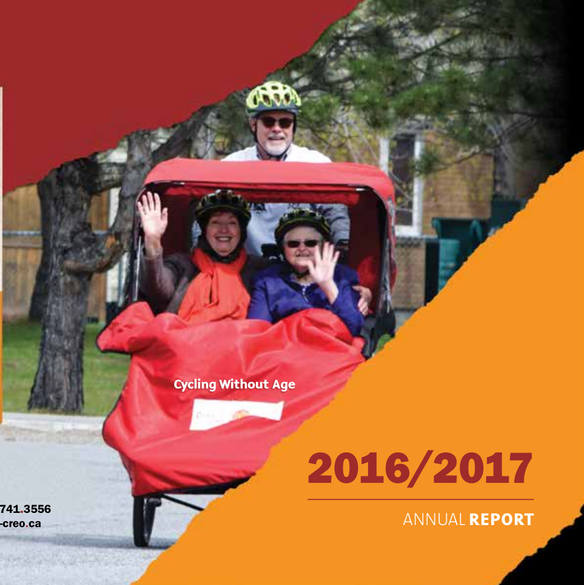
Cycling Without Age

Tel: 613.741.6025 • TTY: 613.741.3556 www.eorc-creo.ca • Info@eorc-creo.ca 1980 Ogilvie Road, Suite 215 B.N. 12960 2470 RR 0001