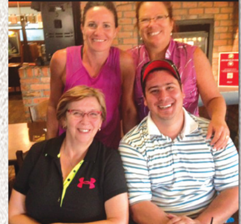
Casey's Golf tournament

We are proud of our tremendously skilled team members, our generous program and special event volunteers, our committed business partners and our dedicated members of the Board. Together we continue to build a healthy and caring community.