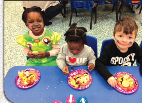
Early Years participants

"Thank you! I don't know where I would be without help from this center."